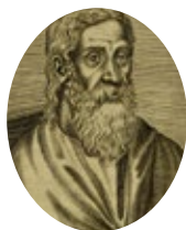
Clement of Alexandria

were condemned as sinners. 41 A commentary of the Didache , the Epistle of Barnabas (written between AD 70-132), said, “You shall love your neighbor more than your own life. You shall not slay the child by abortions. You shall not kill what is generated.” 42